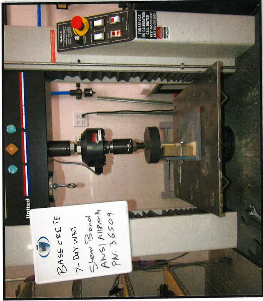
Shear Strength Test