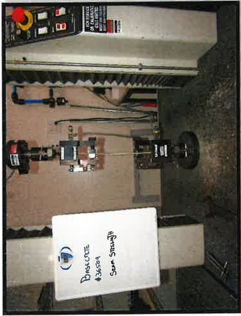
Seam Strength Test